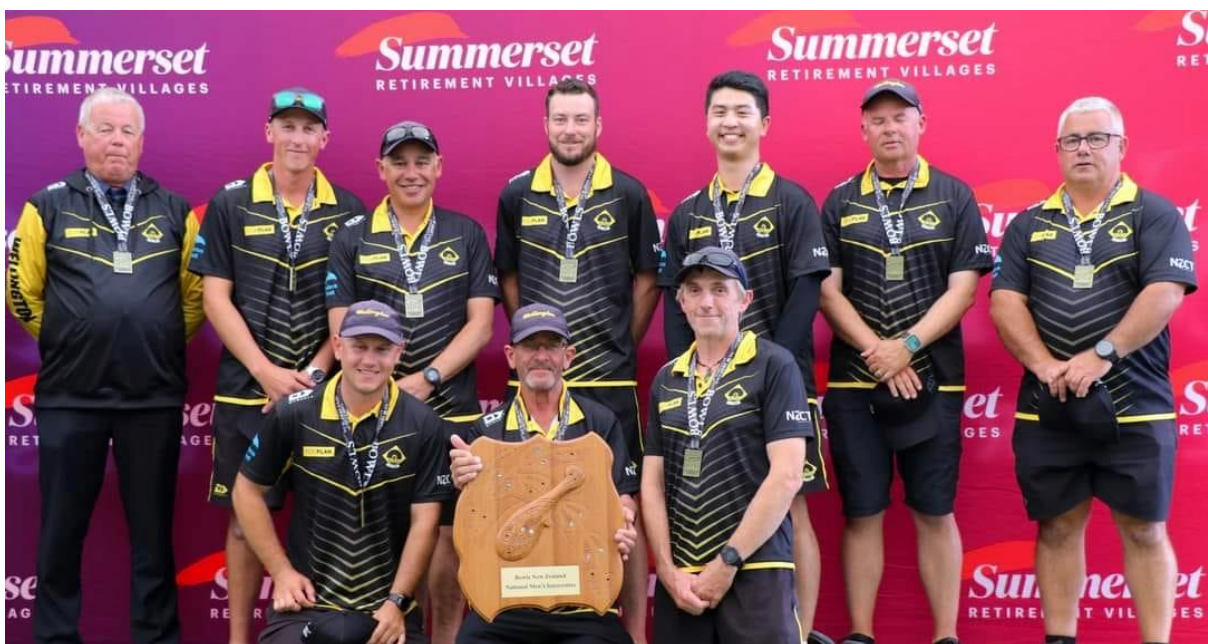
2024 National Men's Inter-Centre Champions